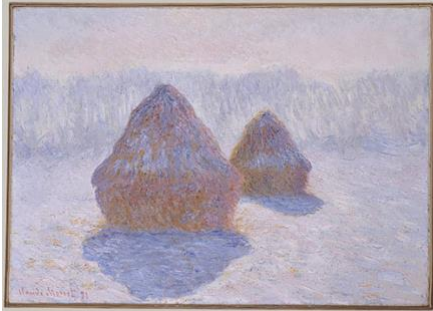
Monet, Haystack Painting